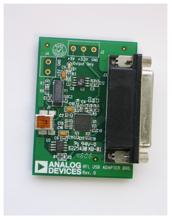
Figure 1. EVAL-ADF4XXXZ-USB Adapter Board

This board is designed to allow currently available evaluation boards that were designed for programming by a PC parallel port to be programmed via the PC USB port. The adapter connects to the PC USB port and the evaluation board's 25-way parallel port connector. For information regarding the evaluation board and operation of software, consult the relevant evaluation board documentation.